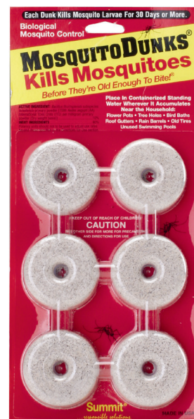
Stop bugs from breeding in standing water on your property with Mosquito Dunks, which are available online from SmartPak Equine.

One nozzle can cover up to a 15-by-15-foot area. It's best to install a nozzle in each stall, in grooming bays, at the entrances and exits of the barn, and even outside in covered paddocks or near a muck pile. Set a timer, and the spray handles the rest—no need to mix, pump, and spray by hand, which can be time-consuming and less